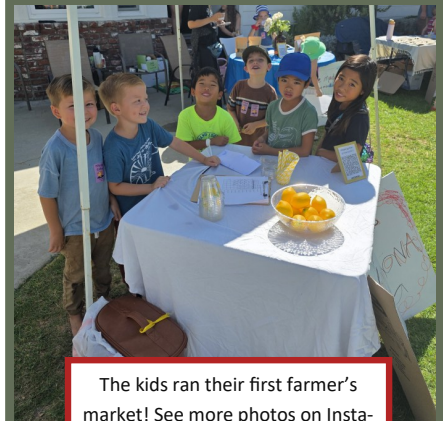
The kids ran their first farmer's market! See more photos on Instagram @BrandtCarson