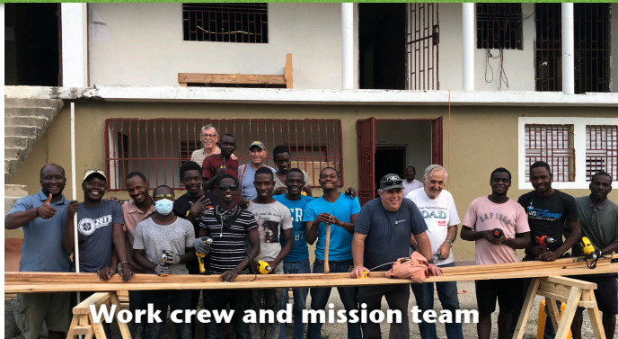
Work crew and mission team