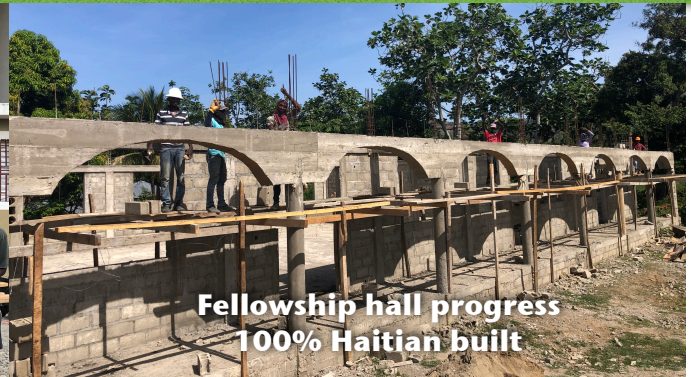
Fellowship hall progress 100% Haitian built