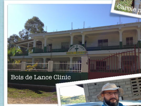
Bois de Lance Clinic