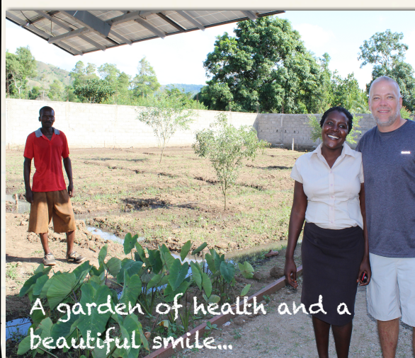
A garden of health and a beautiful smile...