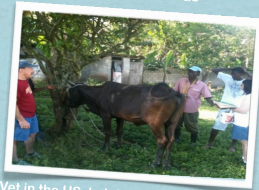
A Vet in the US, helping to vaccinate the ODH cows