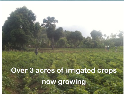
Over 3 acres of irrigated crops now growing