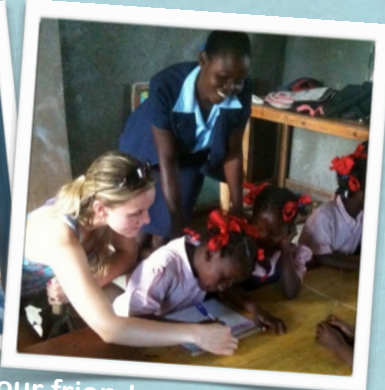
Equipping our friends