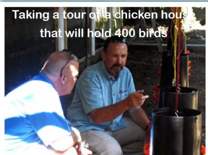
Taking a tour of a chicken house that will hold 400 birds