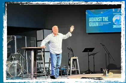
Church partners rock

It will take some time to buy a motorcycle.