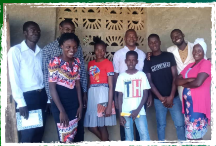
Second trade school

Ministry partners of THM have invested into another trade school in the Central region of the country.