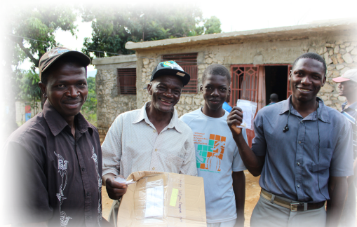
members of the Magayaue church receive seeds to distribute in their village

"I have given you every plant with seeds on the face of the earth and every tree that has fruit with seeds. This will be your food." Genesis 1:29