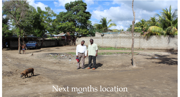
Next months location