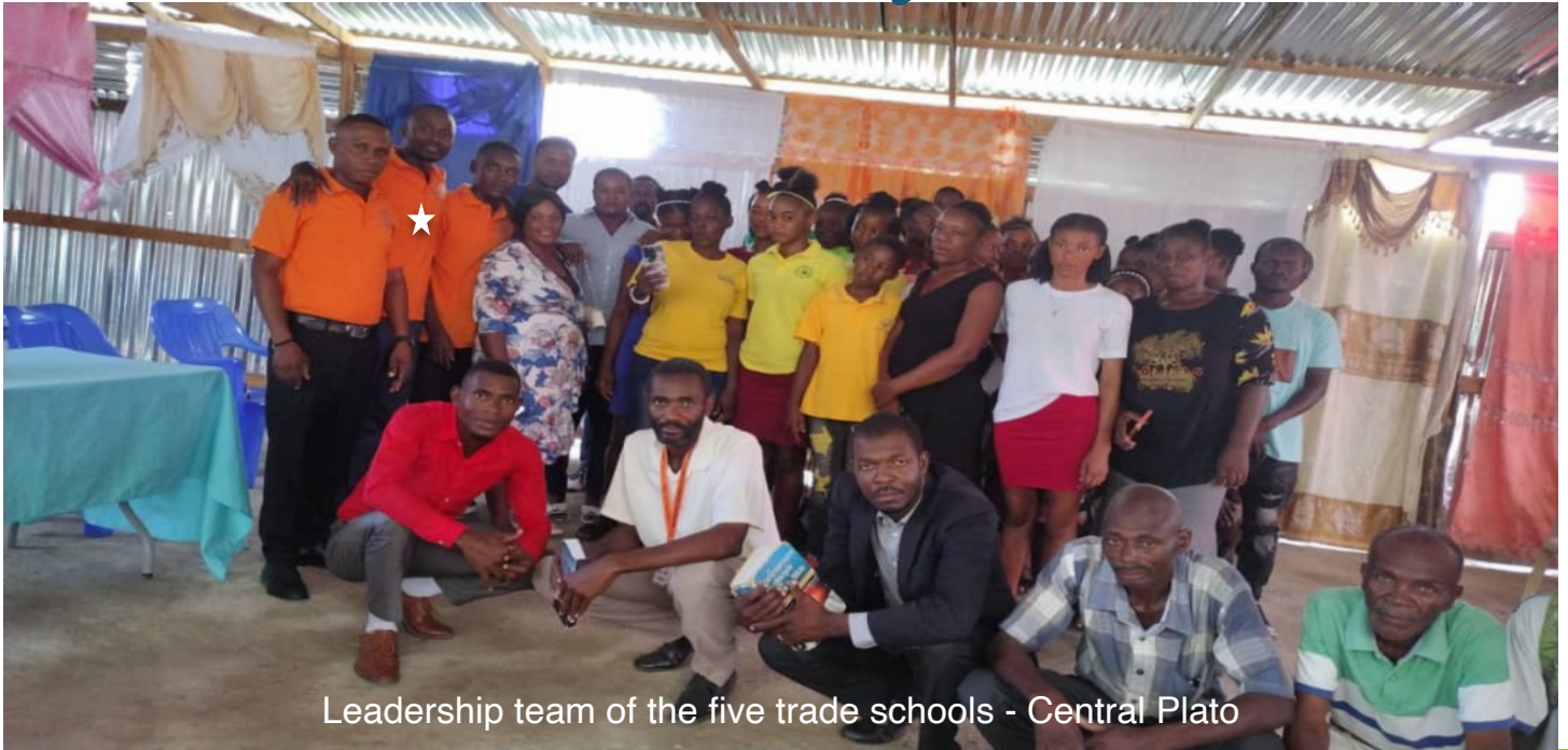
Leadership team of the five trade schools - Central Plato

The Central Plato of Haiti has over ten Open Door churches that work in concert with one another on many aspects of ministry. A major focus for the churches is to equip the saints and outreach. One of the chief strategies they use for outreach is trade schools. Ministry leaders use trade schools to teach a life skill that can produce an income while preaching the sufficiency of Christ during the process. Very effective in reaching young adults.