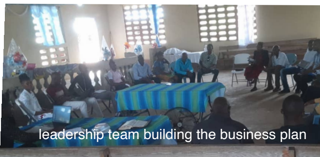
leadership team building the business plan

This is a bold vision, the leaders have planned, God will direct their steps. Can you help?