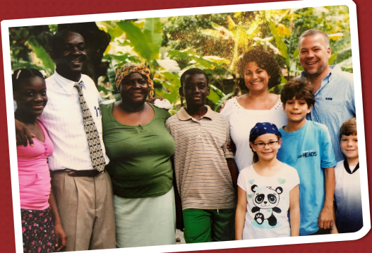
Celebrating twelve years of ministry partnership