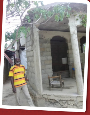
Pastor Oclan's new home

Ministry tractor profits from plowing is sourcing income locally to plant more churches