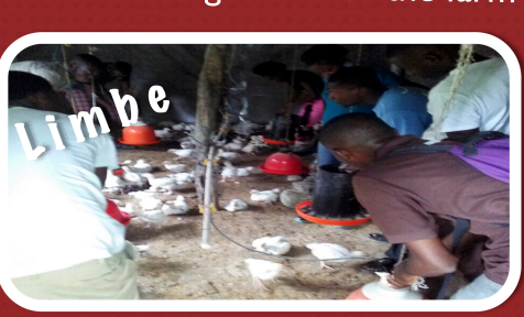
Junior now has over 40 college students learning the precepts of Jesus through teaching poultry business

Faith was increased in many seeing God move in replacing a school roof AND building a wall for the farm