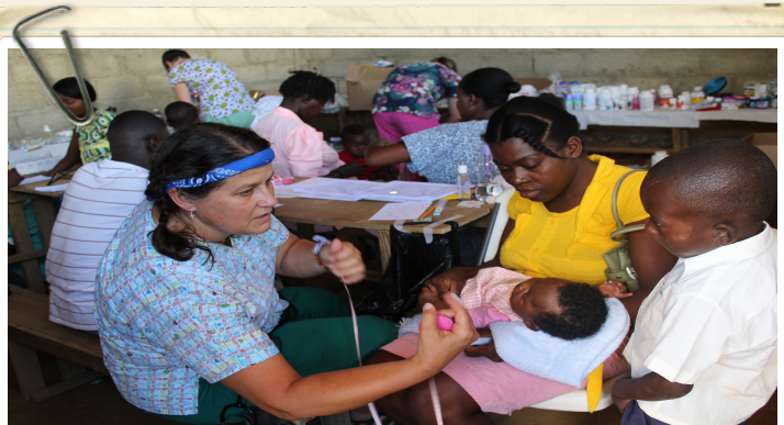
Compassion for the sick

Is God calling YOU to rally your friends to help?