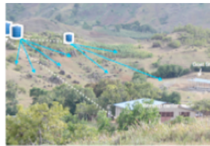
Install proposed irrigation system