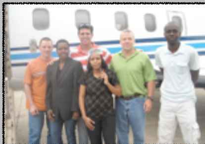
On the ground in Haiti, our relief team is eager to get started after a quick 2 hour flight from Orlando. The doctors are part of the Cap Haitien Health Network that we partner with..