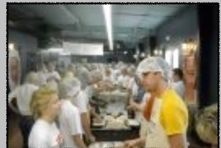
A group of about 50 people from our home church showed up at Kids against Hunger to pack food for Haiti relief.