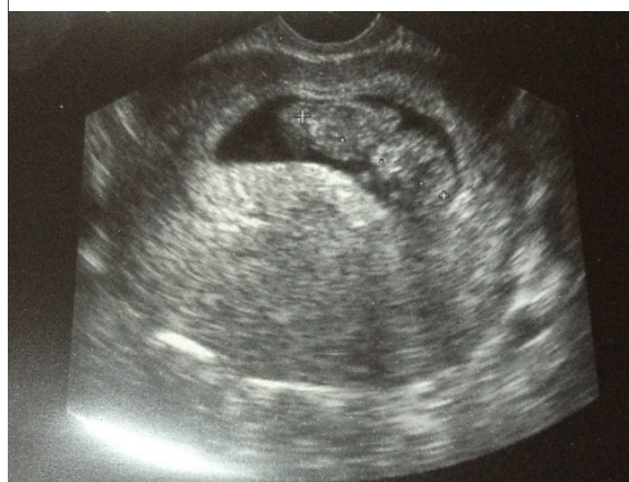
Baby Beneke at 11 weeks on 2/23: coming to Japan in September 2015!