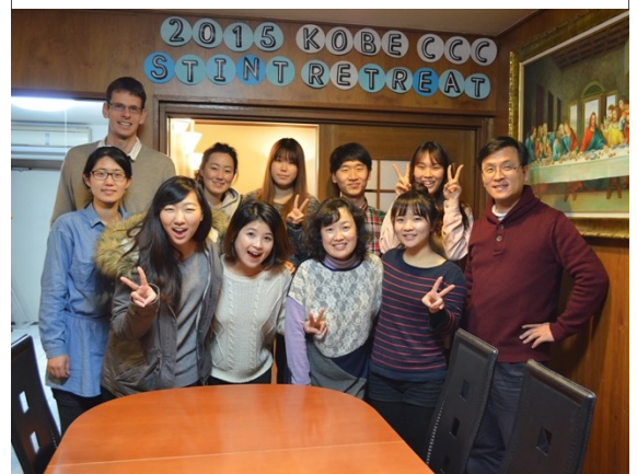
With teammates at our End-of-the-Semester Retreat (1/28~30)