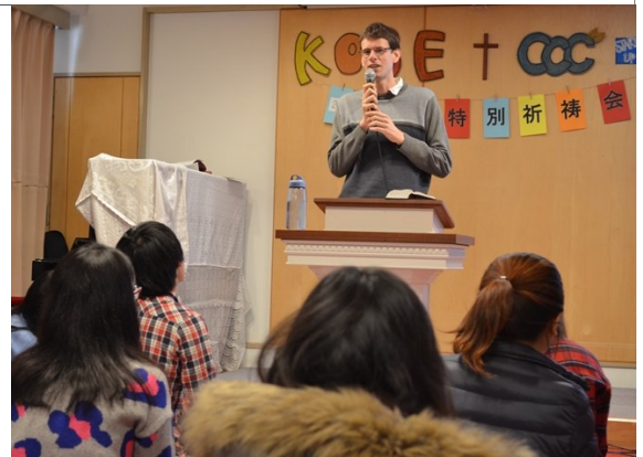
Giving a message at our New Year's Prayer and Fasting Camp (1/1~1/3)

Every February, our Kobe team meets to evaluate the past year's ministry and plan for the year ahead. After we