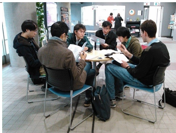
Meeting with other leaders at National Campus Forum (2/23~25) ; I helped to emcee and served on the design team