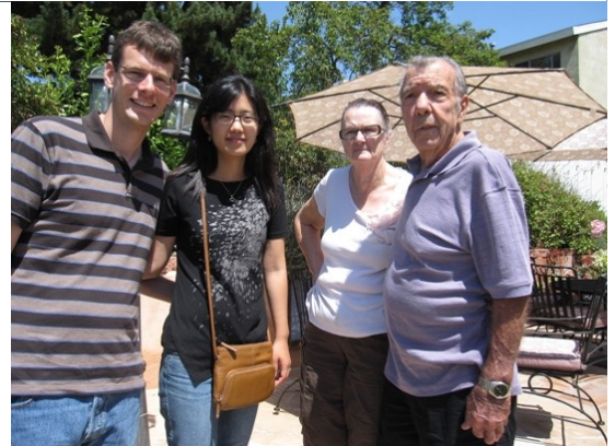
With my grandparents in San Diego