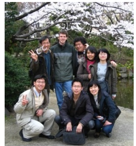
The team on campus this week