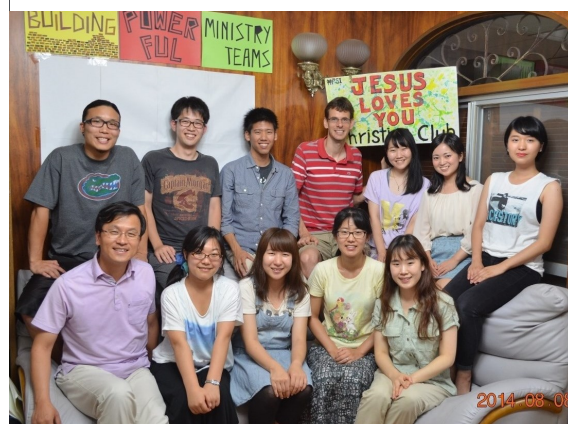
Our team of twelve disciples going to share Christ with college students in Hualien, Taiwan, September 10-23