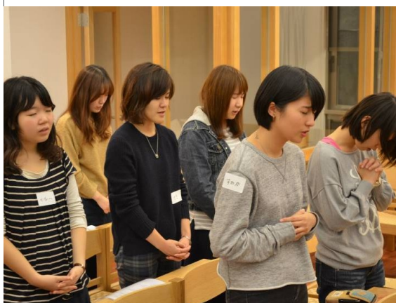
Group prayer time at our Personal Evangelism Seminar earlier this month