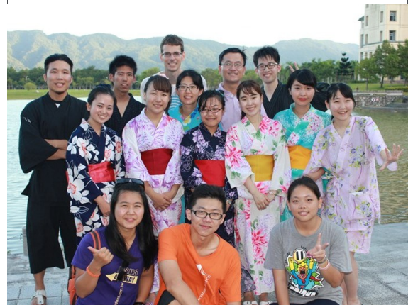
Our team wearing traditional Japanese yukata for freshman orientation