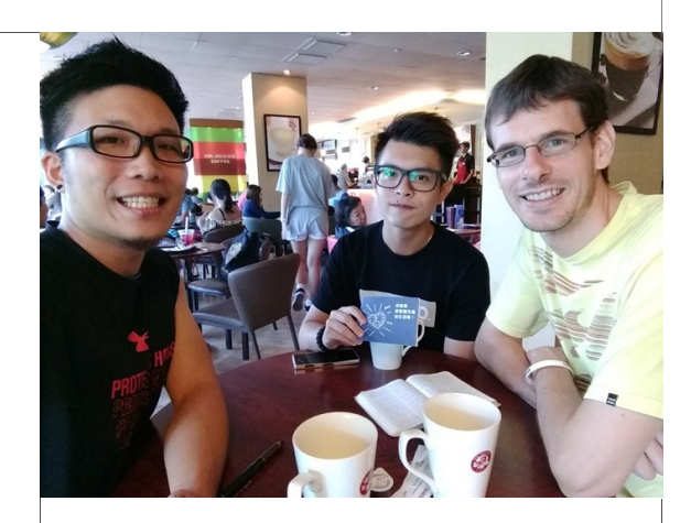
Meeting for follow-up with a young believer during Taiwan Mission Trip