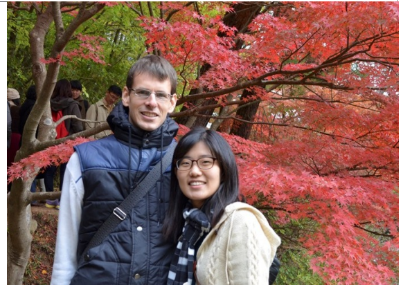
Enjoying fall in the Kobe mountains!