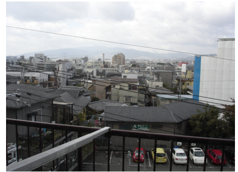
The view from our future home

Because three of us are now living in a tiny apartment built for two, we had to look for a new place to live. Yesterday, we found one! It's only a few minutes' walk from our current home, but it has a nice view of the mountains, three bedrooms, is closer to the train station and is spacious enough to host guests and friends. We plan to move next week. Praise God for his provision!