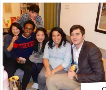
Our International Classmates: Tajik, Tanzanian, Comoran & Burundian

Although we have a smaller-sized apartment, we shot for big numbers and ended up having an average of 40 college students in our living room for two nights of Christmas parties. The next week we had a big group of international classmates over for dinner making it over 100 people in our house in under a week. We felt like we were always either baking or cleaning! This year we were able to have students more involved and had two newer believers share their testimony each night of why they started their relationship with God and had the Christmas story acted out. In the end, we had small groups to share and ask questions. Directly following our parties as we met with students and shared the gospel again, we had a total of 3 new decisions to put their faith in Jesus!