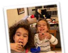
Rolling Sushi & Eating It

Our team is going through evaluations, reviewing each person and trying to grow from what we see in each other. Please pray that goes smoothly and that we end the semester with a fun 2-day retreat in a nearby city. We all will travel to Thailand for our STINT mid-year conference where we will receive counseling and a chance to be with all the other STINTers in Asia. Pray our family will get to physically and mentally rest (at least one family member has been sick for the past month or two) and that we have open hearts to the counseling and teaching we will receive! Thank you for being a part of our lives, our family and our ministry here in East Asia.