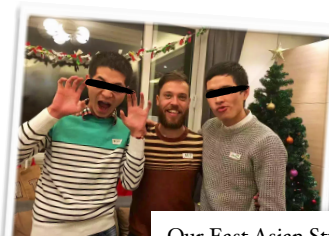
Our East Asian Student Christmas Parties