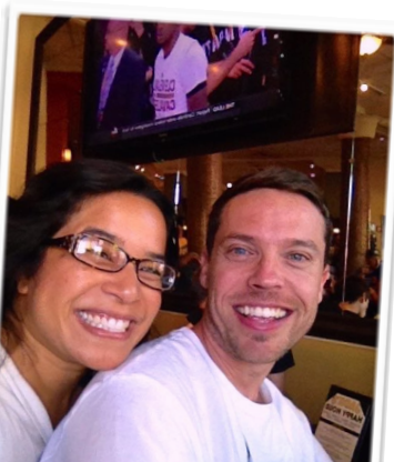
a date night out watching the Warriors win!

discouraged interracial marriage? Its shocking to hear this now, and certainly not flattering as an organization to talk about past mistakes on a national stage. And even more so to address current areas that still need to be changed. Currently, 1 in 200 of all staff are ethnically diverse (non-white). As Epic staff we pray for change and desire to specifically raise up East Asian and Asian-American students who will boldly follow Christ and join us in reaching others for Him. Pray with us as we engage in these discussions, trusting God for change.