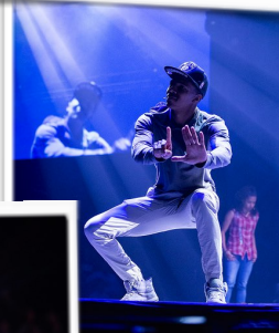
the Cru15 biennial staff conference in Fort Collins, Colorado.