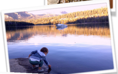
a summer of farmer's markets, lake swims, grandparents, uncles, aunts & cousins. and dogs.