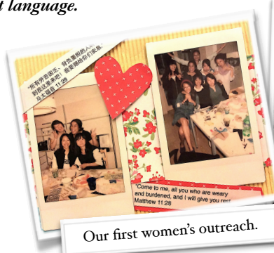
Our first women's outreach.