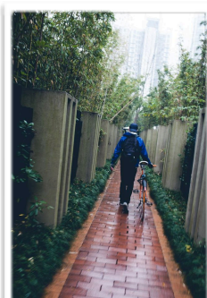
Vision Trip: Exploring campus; post-prayer loitering; a narrow path; breakfast & devos; biking to class; and our nightly cityscape.