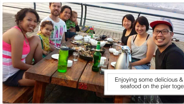
Enjoying some delicious & cheap seafood on the pier together!