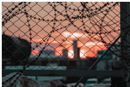
Fence // Central Asia