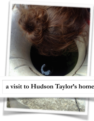
a visit to Hudson Taylor's home