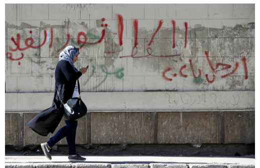
Oasis life in the streets & online // photos by: K. H.