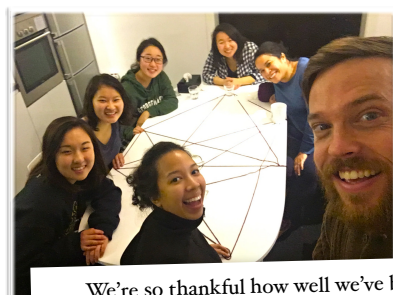
We're so thankful how well we've been connecting with our team these past 6 months!

We've heard many times that the main reason missionaries leave the field is because of team relationships and we fully believe it. Although our team gets along well, it constantly takes work because we are family and conflict comes up within our family often. Could you pray for our team to keep engaging well with each other, especially given the fact that our family will need to leave a whole one to two months earlier to have the baby in America. Please pray for unity, bonding and for our ministry and family unit to be trusting in God's strength and not our own.