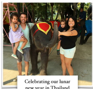
Celebrating our lunar new year in Thailand