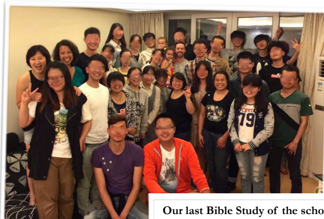
Our last Bible Study of the school year - 26 students came! (above & below)

This year it is undeniable that we have an abundance of fish, in the form of people! We are ALWAYS meeting new people and praying for the Spirit to help us discern who is most open and desiring a relationship with Jesus. We estimate that we as a team of 6 have connected with 500 students this year. We have 7 new disciples and although it seems smart to go after the 500, we are pouring into these 7 so they will disciple others and reach people in their own heart language. We are following Jesus's model of having 12 disciples, and focusing on 3 of the 12 even more so to spread the Gospel to the whole world.