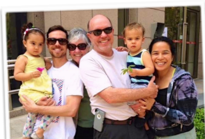
We were blessed to have Nich's parents come live with us and bless us with helping with the kids last month!