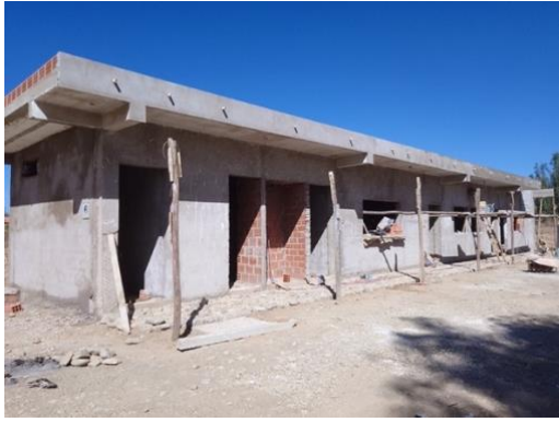
The Front of the building

Some photos to share and a Thank you for making this all possible: