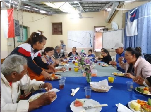
The Senior Dinner and activity