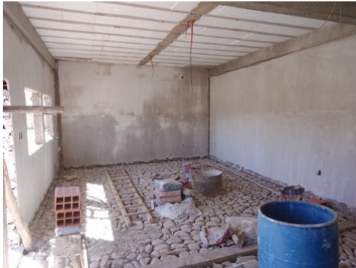
Our Auditorium for now, future classrooms