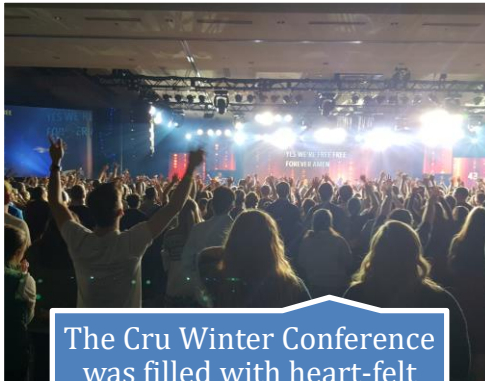
The Cru Winter Conference was filled with heart-felt worship...