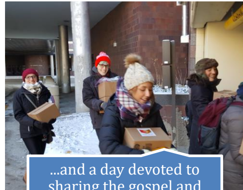
...and a day devoted to sharing the gospel and giving away boxes of food.