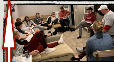
our Old "Normal" the New "Normal"