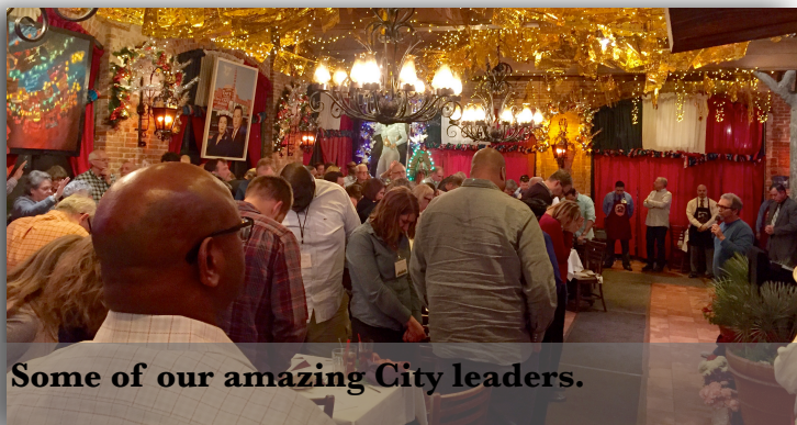
Some of our amazing City leaders.

Cru City is currently at work in several cities around the country, including New York, Los Angeles, Denver, Portland, Minneapolis/St. Paul, and Dallas/Fort Worth. I am so excited that God has called me to serve with Cru City and pray that He would lead you to continue with me in this venture. I cannot do it without you! Your investment of finances and prayers will influence many coming to know Christ and in the transformation of our cities, which will result in the transformation of our world.