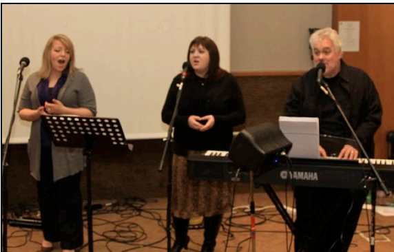
Leading worship at the Bridge launch March 14 in the Rueil-Malmaison Novotel hotel.

Our Delight: We've had our first salvation at The Bridge: a Chinese student, who has attended for several months, gave her heart to the Lord recently. She was invited to The Bridge by a core member from India who met the young lady at UNESCO, where she interns. A divine connection... that's what the Bridge is all about!