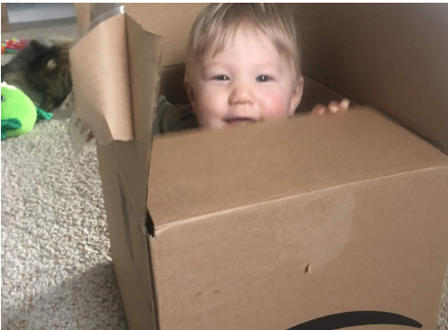
Amazon carries everything these days, right?