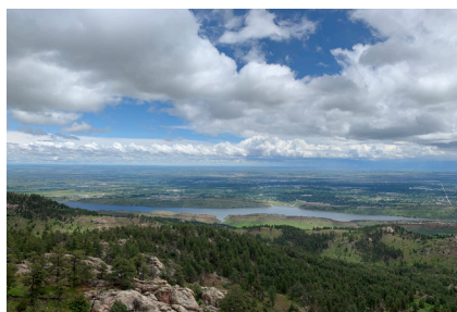
The view of Ft. Collins from the top of Horsetooth Mountain.