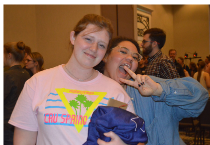
Our students enjoyed the conference, which had morning & evening sessions where they learned from the Bible.