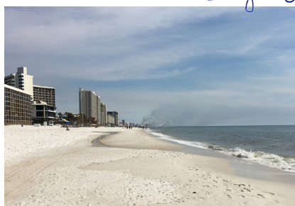
The calm before the party (& the gospel!) took over the beaches. It was overcast most of the time, but we got some sun!