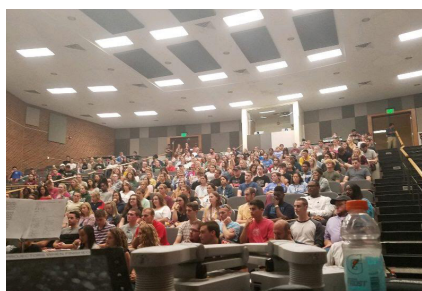
Students packed into Morton Hall 201 for the first 180 meeting of the year!