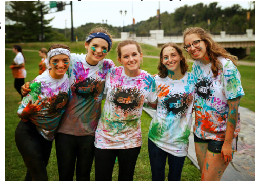
We threw a "Paint Party" last week, which was both incredibly fun and incredibly messy!

It's a challenging season for me as I learn to balance the ministry of motherhood with the ministry of missions, but I am grateful for the opportunity. We are grateful for your prayers as we adjust, and ask you to keep lifting us up to the Father in our ministry - both at home and on campus.