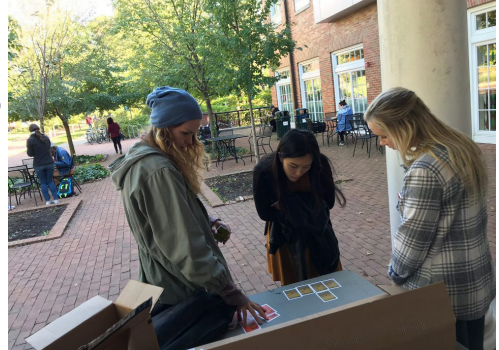
side of the OU Student Center.

The goal of the outreach was to open up dialogue with students who might not otherwise want to engage with Christianity, and hopefully give an opening to share the Gospel with them in a way they could understand. Students engage with the outreach out-