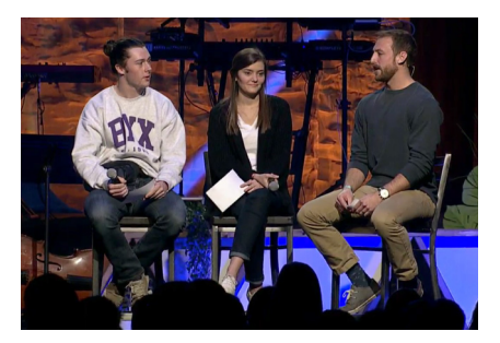
Students share their experience with sharing their faith on stage, explaining how God used it to grow them.

"Coming here has really brought a lot of clarity and a renewed focus on the Lord that I really needed."