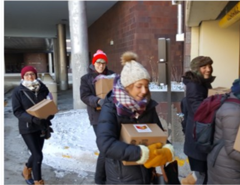
...as well as time to love the city with boxes of food and sharing the gospel.