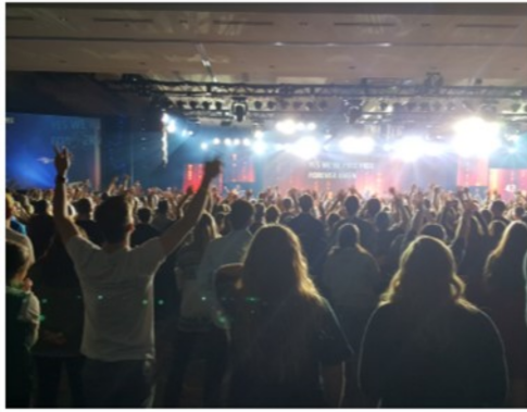
At our Cru Winter Conference, there was heart-felt worship...