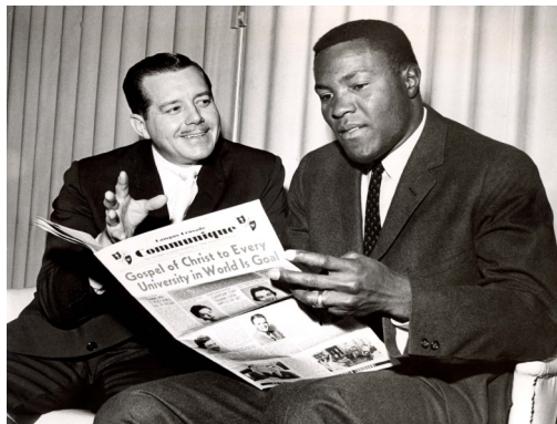
Cru founder Bill Bright with Olympic decathlete Rafer Johnson.

Athletes can be a key factor in reaching others. Cru has realized this since its beginnings at UCLA in the 1950s. In the 1960s, Cru launched Athletes in Action, which reaches and equips professional and amateur athletes to serve in scores of countries. AIA's tremendous platform includes hosting the annual NFL-sanctioned Super Bowl Breakfast where the Bart Starr Award and the hope of Christ is presented. This year 60 people indicated decisions to accept Christ after the event and 200 more expressed interest in learning about the Christian faith.