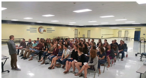
Evangelism training before first sharing