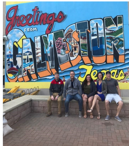
The Cru staff and volunteer leaders posing sharing in Galveston