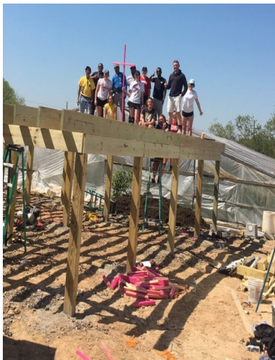
Together they're building new houses