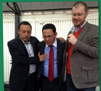
PRAYING FOR THE NATIONAL SUPERINTENDENT OF ECUADOR