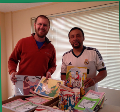
THANK YOU LFTL FOR THIS SUNDAY SCHOOL MATERIAL

be there. Trust me, it's going to be just as hard on them as it is on us because we are a really close family. But our God is big and He is faithful and we choose to follow Him, no matter the cost. We will trust Him with our kid's futures and all the great things He has in store for them. Please be in prayer for our "real life stuff."