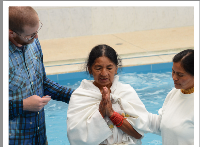
BAPTISM IN OTAVALO