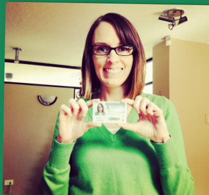
I MADE A 100 ON MY DRIVERS TEST AND NOW HAVE MY LICENSE.