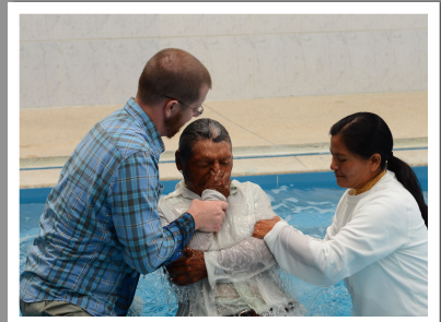
BAPTISM IN OTAVALO