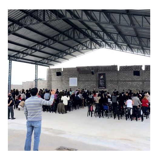
Our church in Quito, has grown so much. God has blessed us with land and a church that we can call our own.

The Middle of the World museum tour guide.