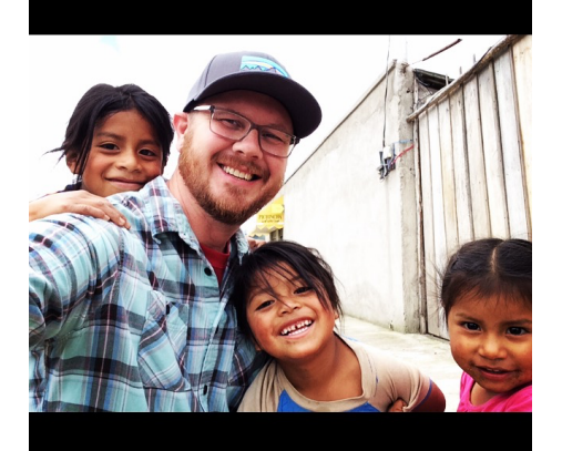
Christmas day in a Quichua village handing out some Christmas goodies.