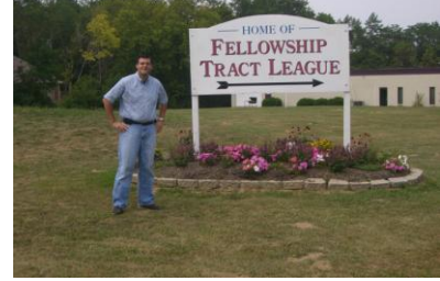
A VISIT TO THE MINISRTY OF TRACTS