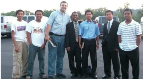
FELLOWSHIPING WITH FUTURE FILIPINO MISSIONARIES IN MARRITTA, OH