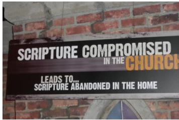
I saw this at a creation museum