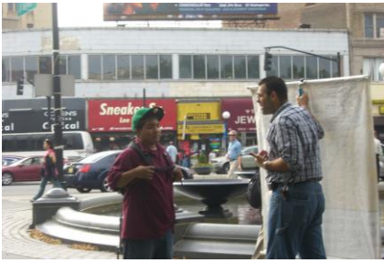
ONE ON ONE, WINNING "WON BY ONE"