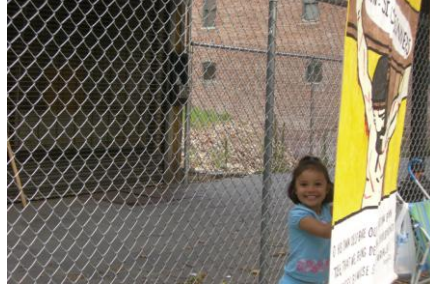
LITTLE AIDS IN THE MINISTRY!