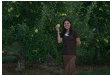
ORGANIC ! APPLE PICKING