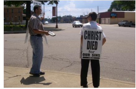
STREET PREACH TIME