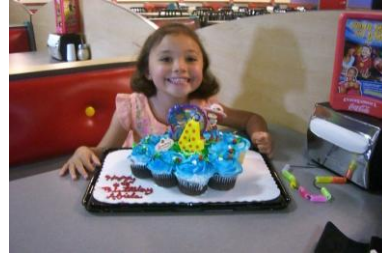
THE BIRTHDAY GIRL!