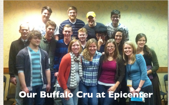
Our Buffalo Cru at Epicenter