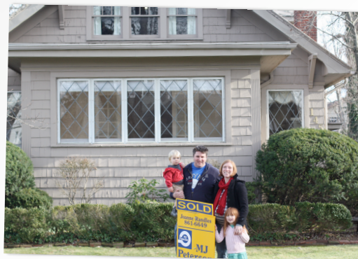
WE BOUGHT OUR 1ST HOUSE JUST IN TIME FOR BABY #3!!

Thank you for your faithful partnership in reaching students in Western New York!