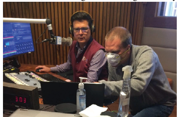
Troubleshooting in the studio

Radio is reaching more people than ever during this time, and our message is “Live with Hope”. The programs have changed a bit, with most of the producers (on air voices) working from home and calling in over ZOOM when they are on-air. Geoff and the other engineers were busy the first two weeks of lockdown getting all the technical details worked out, now things are running smoothly.