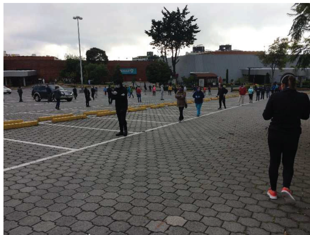
Part of the line for the supermarket