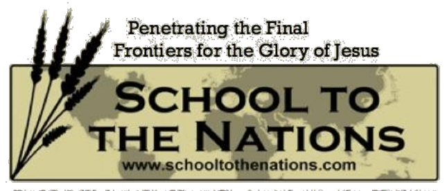
By Mobilizing the Next Generation to the Nations

On a rainy Missouri Saturday, we had a room full of students piled in our training center. We spent the day investigating the art of storytelling, experiencing the story of God's word and exploring the host