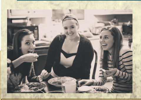
Sweet Blessings... Throughout all of the travel, change, and craziness of this season of ministry, these two beautiful and silly roommates have been continual encouragement and joy!

There will be more first days to come as we prepare for outreaches to Southeast Asia and national cross cultural projects. I am excited to have our classroom seats full again with students investing in the Gospel and missiology, but most importantly I am excited to see God transform hearts in this classroom and to the farthest reaches of His creation. Please join me in praying for our students and the people we will meet along these exciting journeys.